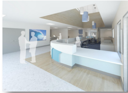
Figure 4: Proposed Internal Views