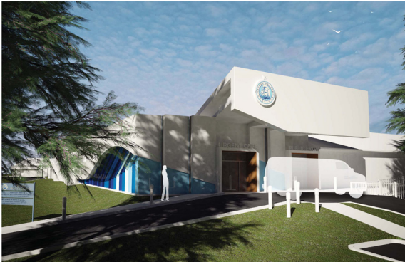
Figure 3: Proposed View of Stage 1C