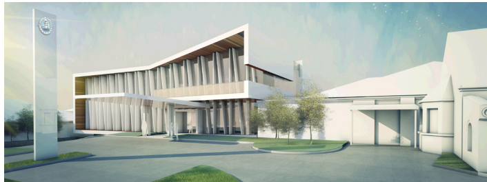
Figure 1: Proposed View of Stage 1A & 1B