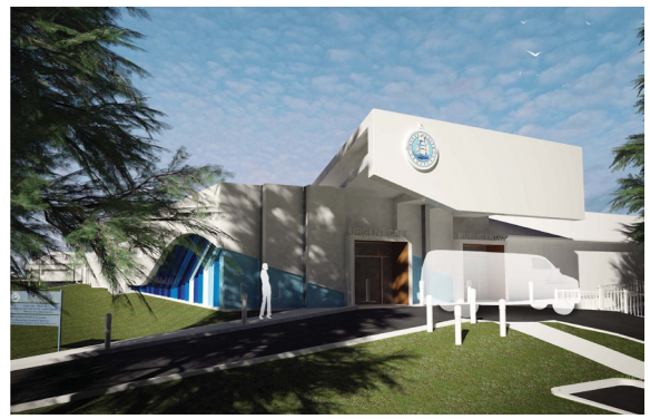
Figure 3: Proposed View of Stage 1C